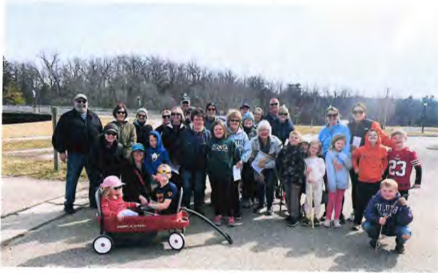
Holy Hike, March 2024