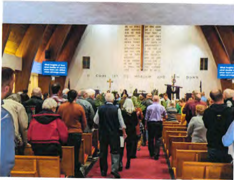
Palm Sunday worship service