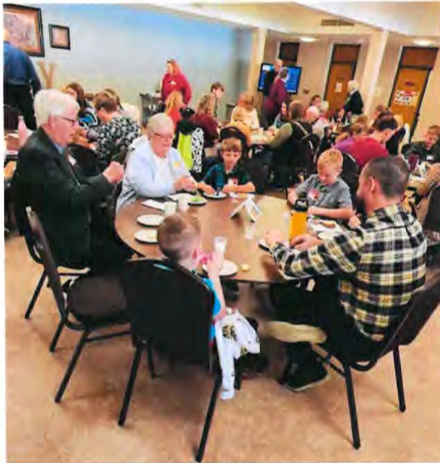
Generous Together Cross+Generational Sunday School