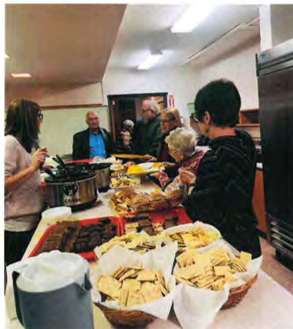
Lenten Soup Supper