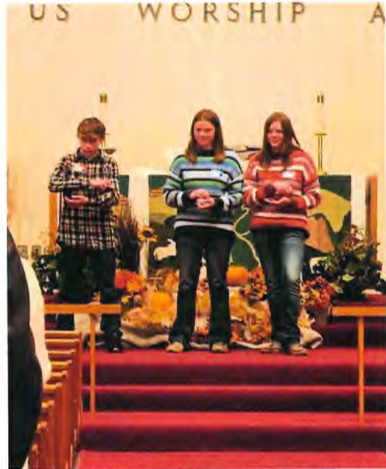
Confirmation students leading sign language during Generous Together worship