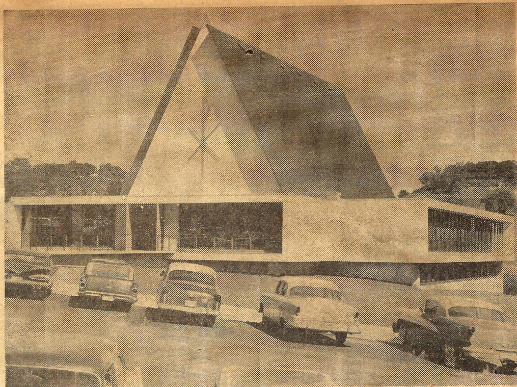
NEW PRESTON CHURCH—The new Christ Lutheran Church at Preston will be dedicated Sunday. The church has been in use about two weeks.